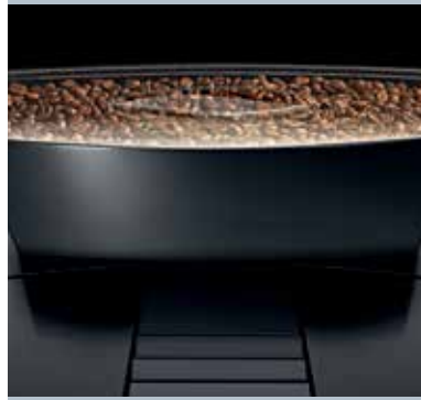
Professional ceramic disc grinder