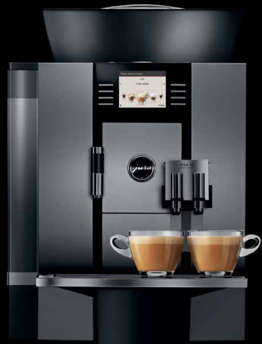
GIGA X3 Professional

With a wide selection of accessories including a cup warmer, milk cooler, coffee grounds disposal function set, drip drain set and interface for accounting systems, as well as an attractive range of storage and presentation units, it is possible to create a complete coffee solution tailored to your specific requirements.