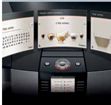
Customisable start screen