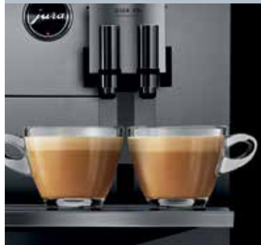
Variable dual spout with 2 coffee spouts and 2 milk spouts